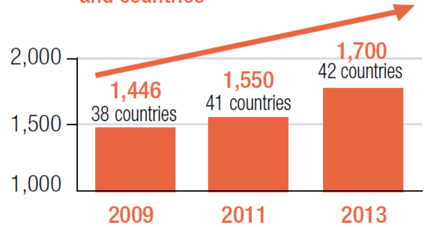
Number of exhibiting companies and countries