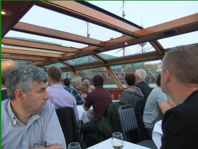
Boat trip through the canals of Amsterdam including dinner on board