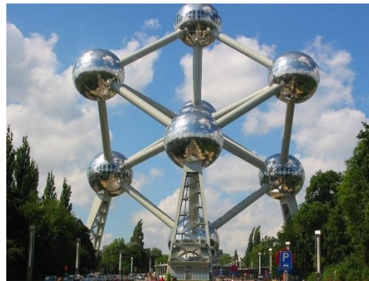
CLIMMAR Congress, 15-17 October 2015, Stockholm, Sweden